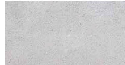
DOVER ACERO 31,6x59,2x0,9cm P3219280 / 100157353 G226 Butech recomienda junta / Butech recommends joint: Colorstuk Rapid n Gris B22502013 / 100004305