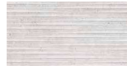
DOVER MODERN LINE CALIZA 31,6x59,2x1,14cm P3219282 / 100157374 G233 Butech recomienda junta / Butech recommends joint: Colorstuk Rapid n Gris B22502013 / 100004305