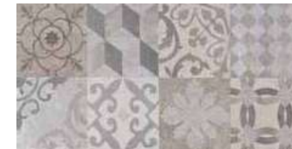
DOVER ANTIQUE 31,6x59,2x0,9cm P3219277 / 100157355 G233 Butech recomienda junta / Butech recommends joint: Colorstuk Rapid n Cemento B22502004 / 100004297