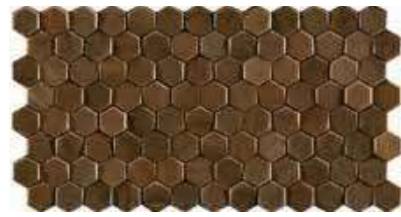
FOREST CHELSEA NUT 31,6x59,2x1,1cm P3219287 / 100173327 G235 Butech recomienda junta / Butech recommends joint: Colorstuk Rapid n Tabaco B22502011 / 100004304