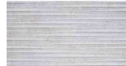
DOVER MODERN LINE ACERO 31,6x59,2x1,14cm P3219281 / 100157373 G233 Butech recomienda junta / Butech recommends joint: Colorstuk Rapid n Gris B22502013 / 100004305