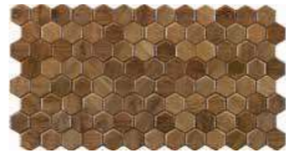
FOREST CHELSEA CAMEL 31,6x59,2x1,1cm P3219289 / 100173326 G235 Butech recomienda junta / Butech recommends joint: Colorstuk Rapid n Tabaco B22502011 / 100004304