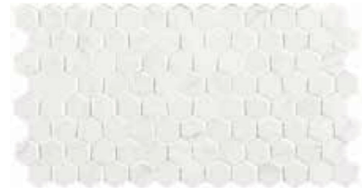
FOREST CARRARA BLANCO 31,6x59,2x1,1cm P3219288 / 100173324 G235 Butech recomienda junta / Butech recommends joint: Colorstuk Rapid n Blanco B22501001 / 100004294