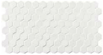
FOREST MARMI CHINA 31,6x59,2x1,1cm P3219285 / 100173334 G235 Butech recomienda junta / Butech recommends joint: Colorstuk Rapid n Blanco B22501001 / 100004294