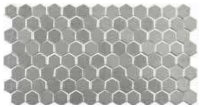
FOREST SILVER 31,6x59,2x1,1cm P3219286 / 100173319 G267 Butech recomienda junta / Butech recommends joint: Colorstuk Rapid n Cemento B22502004 / 100004297