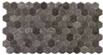
FOREST SLATE 31,6x59,2x1,1cm P3219290 / 100173335 G235 Butech recomienda junta / Butech recommends joint: Colorstuk Rapid n Antracita B22502005 / 100004298