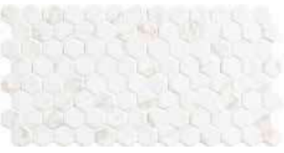
FOREST PERSIA 31,6x59,2x1,1cm P3219295 / 100179117 G235 Butech recomienda junta / Butech recommends joint: Colorstuk Rapid n Blanco B22501001 / 100004294